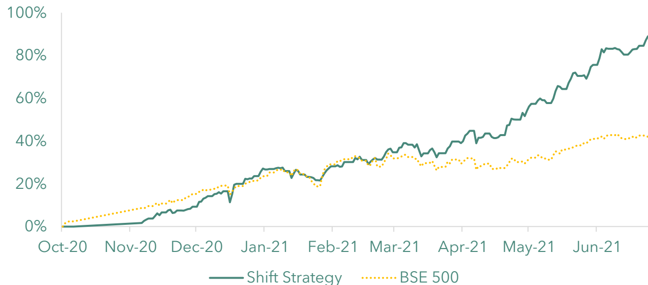
Performance chart since inception